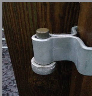
New gate eye and hinge pin