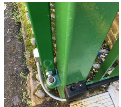
Crushing risk from reducing gap around the hinge