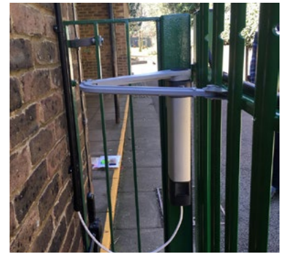
Serious crushing risk with the operator and wall

Action taken: Gate Safe informed the headmaster who immediately took the gate out of automatic operation. Quotes were then obtained to make the system safe and the appropriate remedial works were carried out.