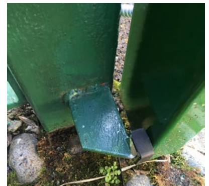
Crushing risk at ground level