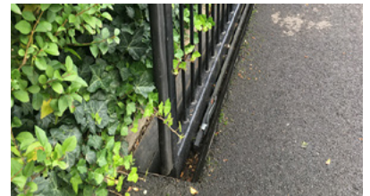
Risk of dragging and drawing in