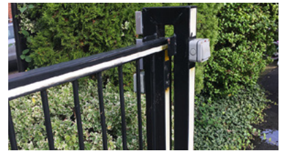
Risk of impact and crushing