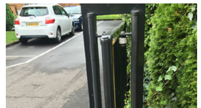
Risk of impact and crushing