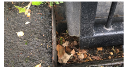
Risk of impact and crushing