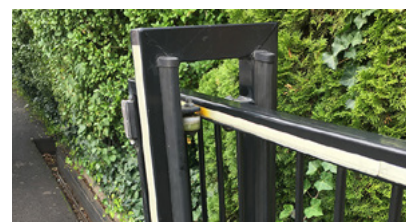
Risk of dragging and drawing in